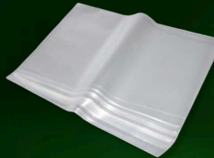
Polypropylene Bags - 100g to 25kg