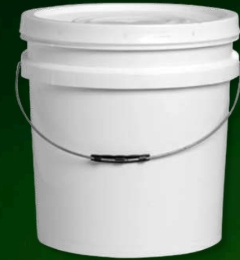
Polypropylene Buckets - 18kg