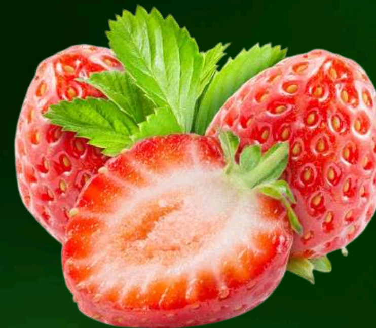
STRAWBERRY Concentrated and whole pulp: Aseptic.