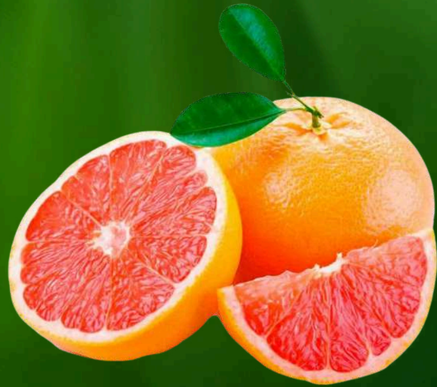
GRAPEFRUIT Concentrated pulp: Aseptic.