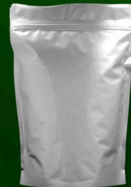
Aluminium Bag - 100g to 25kg