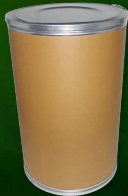
Paper Drums - 30kg