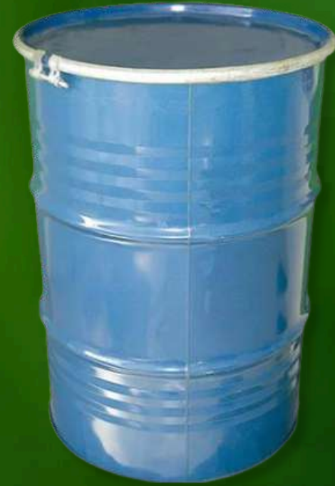
Metal Drums - 180kg