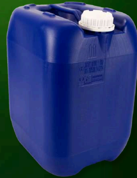
Polypropylene Jerry Cans - 30 or 60kg