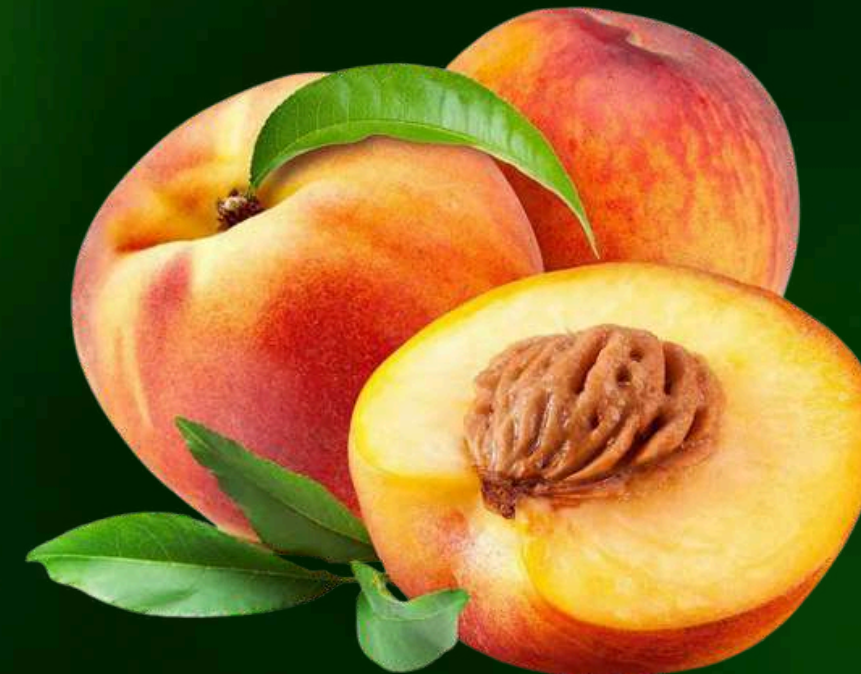
PEACH Concentrated and whole pulp: Aseptic.